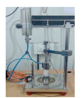
Laser Based Volume Change Measuring Device