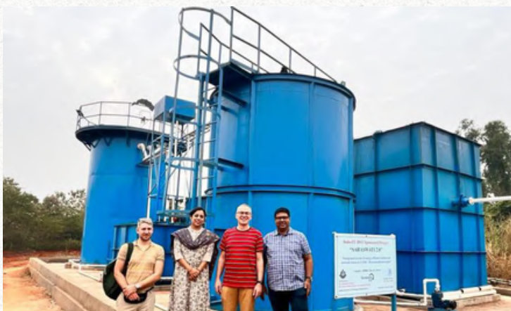
Pilot Plant for conversion of wastewater to biogas

With an objective to protect and preserve the environment for the future, IIT Bhubaneswar has initiated a campaign to stop using single-use plastic, including single-use plastic bottles in its campus. As part of the Swachha Bharat Mission, the Institute has also formed a Solid Waste Management Committee oversee the solid waste management efforts within the campus. The Committee has plans to implement Waste Segregation by Residents, Hostel and Schools across the campus premises.