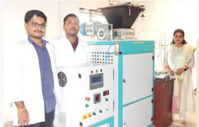
Solar powered microwave pyrolysis reactor for converting waste to value added products