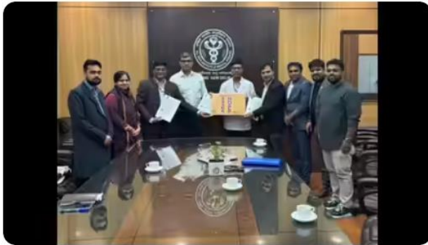
AIIMS Delhi and IIT-Bhubaneswar officials sign the MoU in Delhi

Bhubaneswar: AIIMS Delhi launched a health-education initiative with the IIT Bhubaneswar Research and Entrepreneurship Park (IIT Bhubaneswar REP) to strengthen mental-health capacity and modernise medical training across the country.