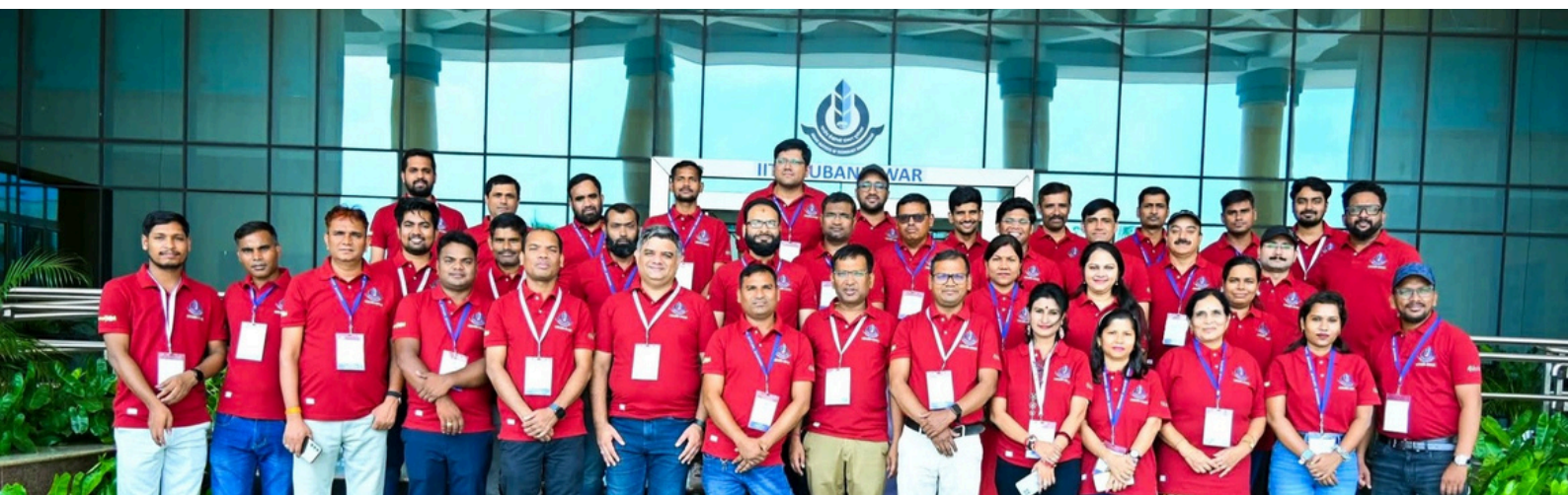
Group picture from OSLMS – 2025

Road Routes: IIT Bhubaneswar is about 30 km from the Bhubaneswar City and 5 Km from Khordha Road Railway Station.