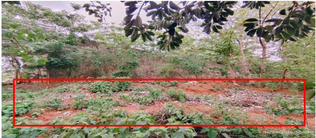
L gate side residential area